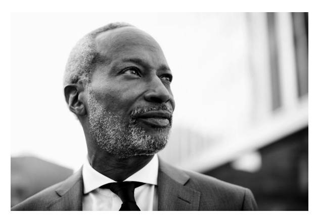
Exhibit 1: Chief Executive Statement: Report on Performance (year ended 30 June 20X8)